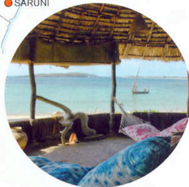
Shore bet: open-side beach huts in Kiwayu

Minutes after our bag drop (the airstrip is only a sandy, ten-minute Land Rover ride away) we quickly established a gruelling schedule of delightful lethargy punctuated with epicurean catering. One day we took out a lovely old dhow boat for a slow and lazy sail up the coast. Another time we went on what Kiwayu grandly terms a "foot safari" (a walk) up the beach. But that was about as active as we got for four wonderful days. Otherwise we lay around, ate, read and slept until the