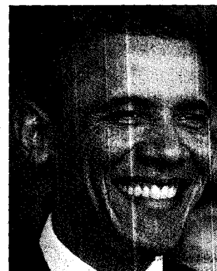
Lamu’s laid-back ambience and isolated location has attracted everyone from Kate Moss to Barack Obama